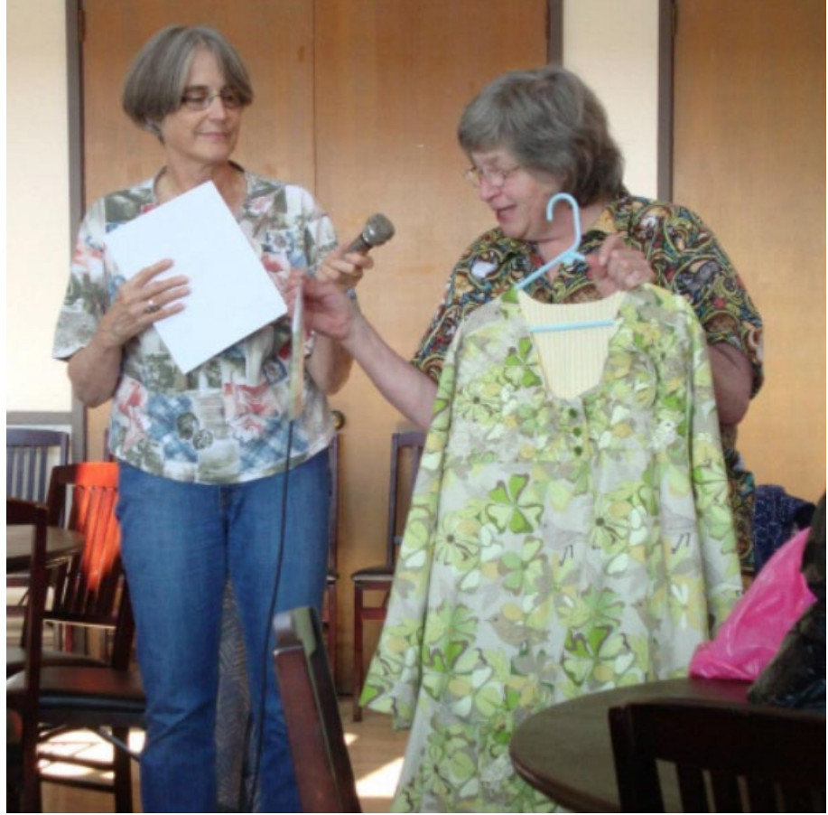
Mistress of ceremonies at Brown Bag "reveal"