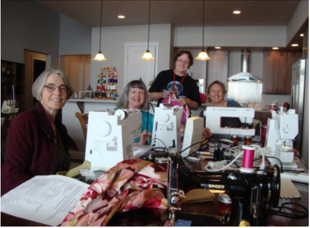
A sewing play date at Francie's 9hostess with the moistest)