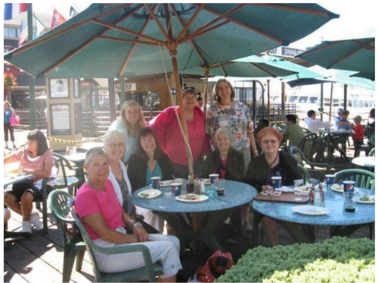
Road Trip to Cicada and lunch on the waterfront after. Fun fun fun!!